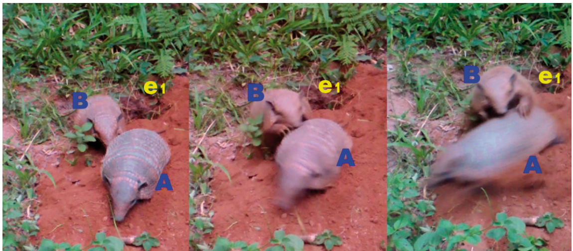
Figure 2. Two-second sequence of Euphractus sexcinctus in which a male (B) tried mounting a female (A).