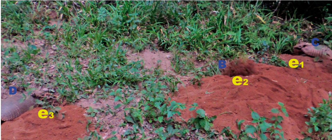
Figure 3. Social behavior of Euphractus sexcinctus showing tolerance between resident individuals B, C, and D.