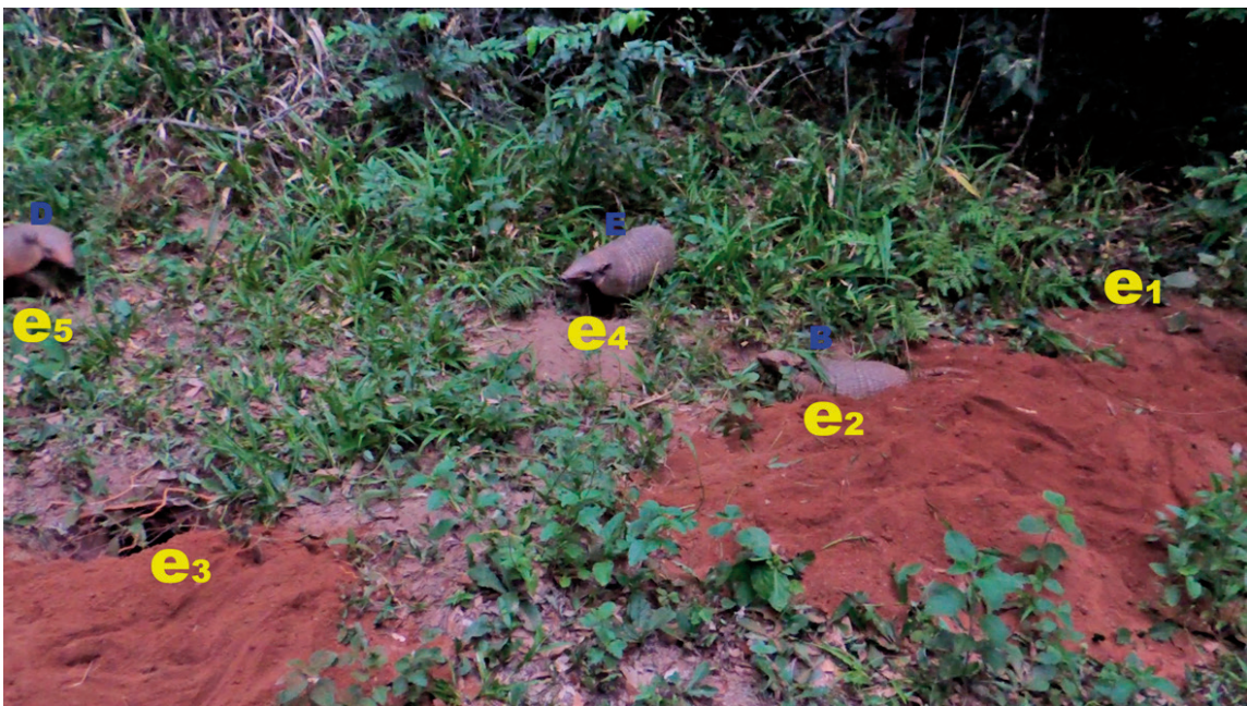
Figure 4. Social behavior of Euphractus sexcinctus showing non-resident individual E approaching the burrow complex, and resident individuals (B, D).